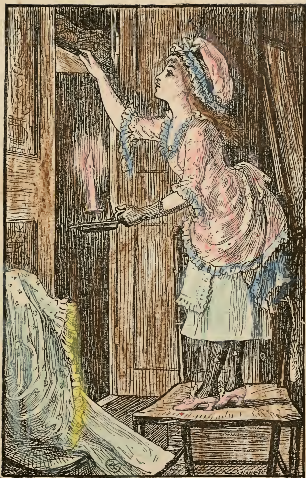
BY STRETCHING A GOOD DEAL SHE THOUGHT SHE COULD REACH THEM. —Page 204.